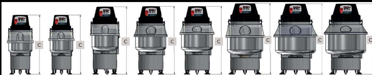
Spiral Evo 50 Spiral Evo 70 Spiral Evo 80 Spiral Evo 110 Spiral Evo 150 Spiral Evo 200 Spiral Evo 250 Spiral Evo 300