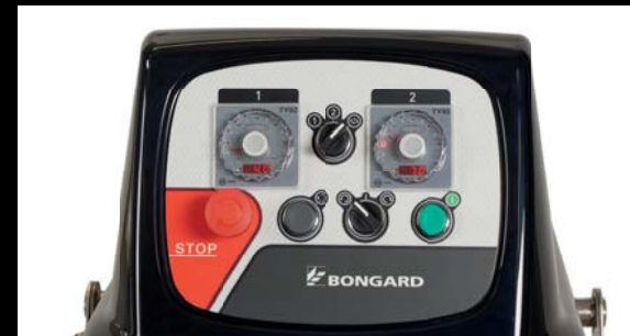
Electromechanical for models 80 and more