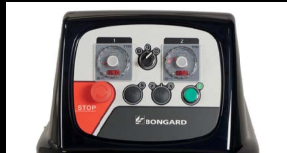
Electromechanical controls for models 50 and 70